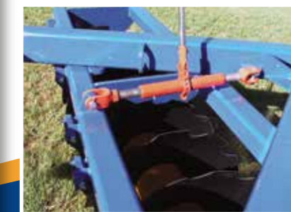
New gang adjust helper ratchet