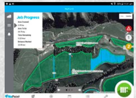
NuPoint app in action