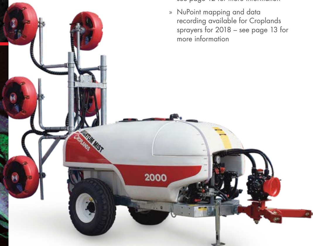
2000 litre Quantum Mist™ XL series sprayer with 3 fans per side, standard self-steering drawbar, single axle and 180 L/min diaphragm pump.