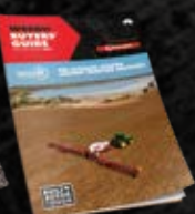
WEEDit Optical Spot Spraying