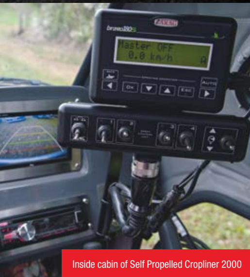
Inside cabin of Self Propelled Cropliner 2000