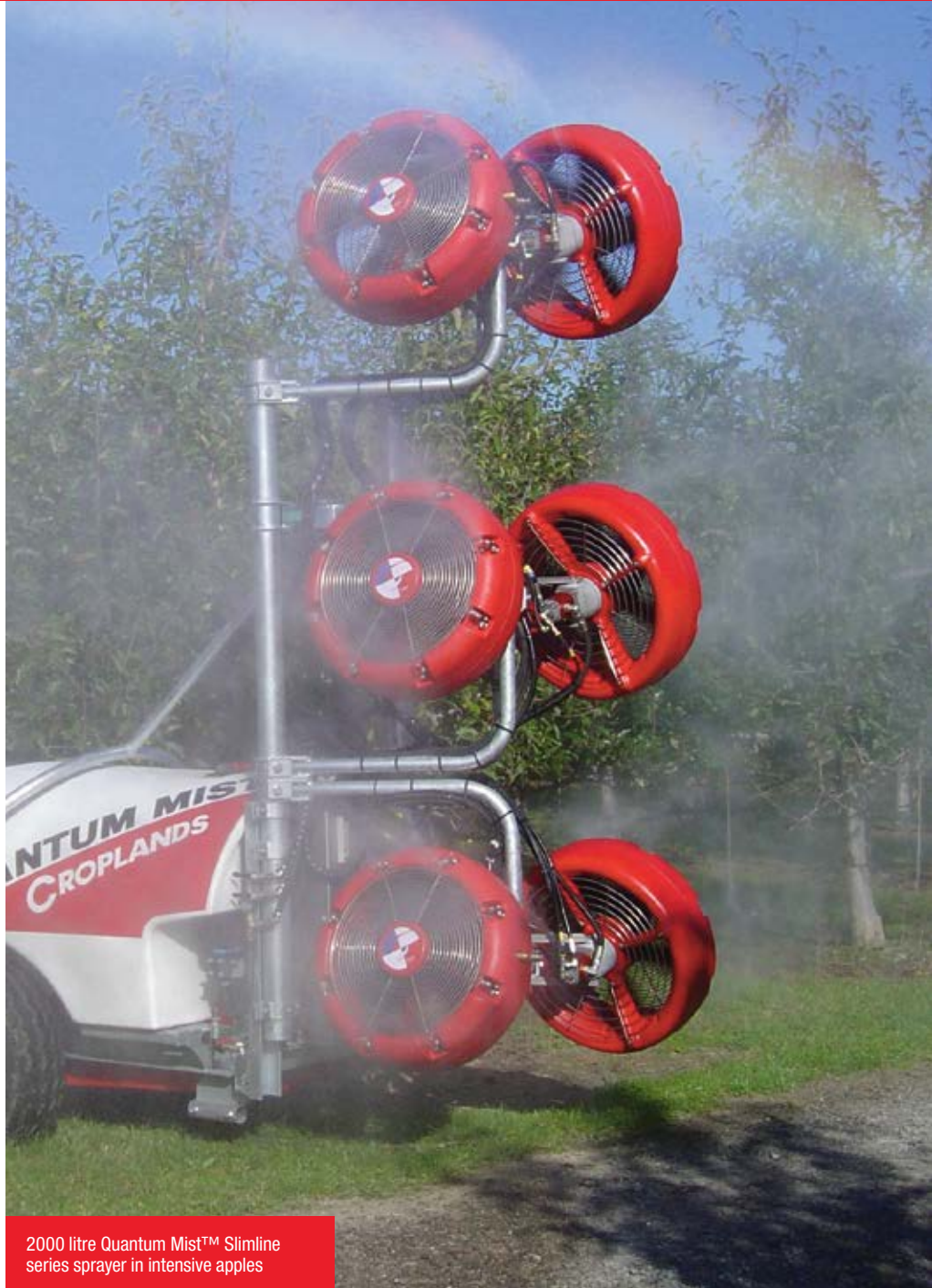
2000 litre Quantum Mist™ Slimline series sprayer in intensive apples