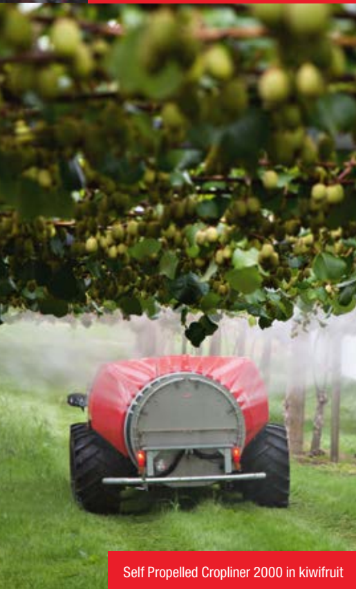
Self Propelled Cropliner 2000 in kiwifruit