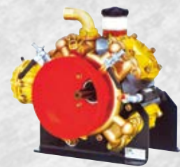
Heavy duty brass 170 pump standard