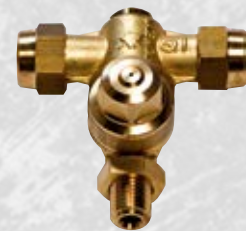
Brass roll over nozzle bodies standard on both fans