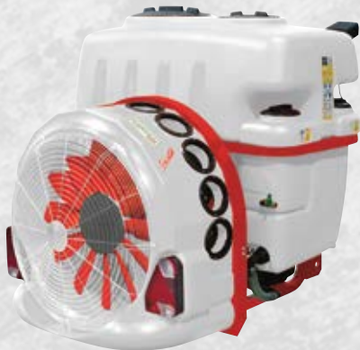
600 litre Cropair with 800mm fan