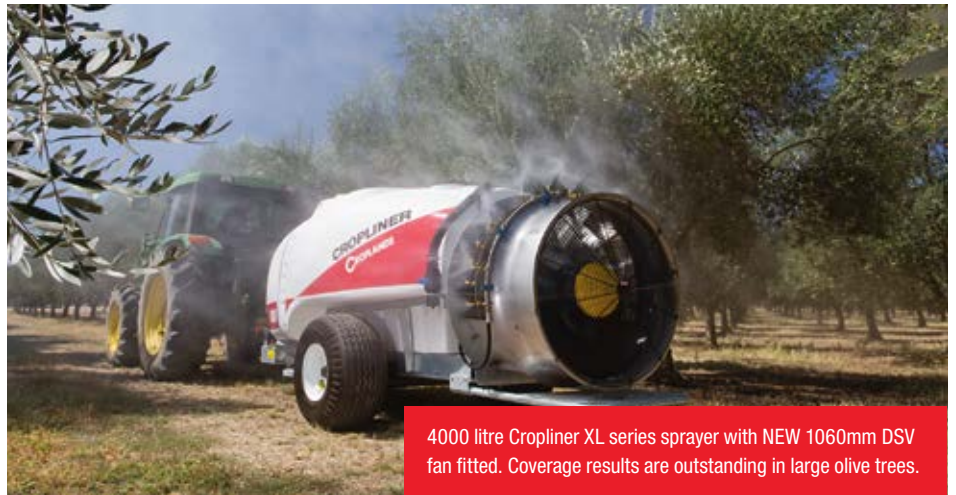
4000 litre Cropliner XL series sprayer with NEW 1060mm DSV fan fitted. Coverage results are outstanding in large olive trees.