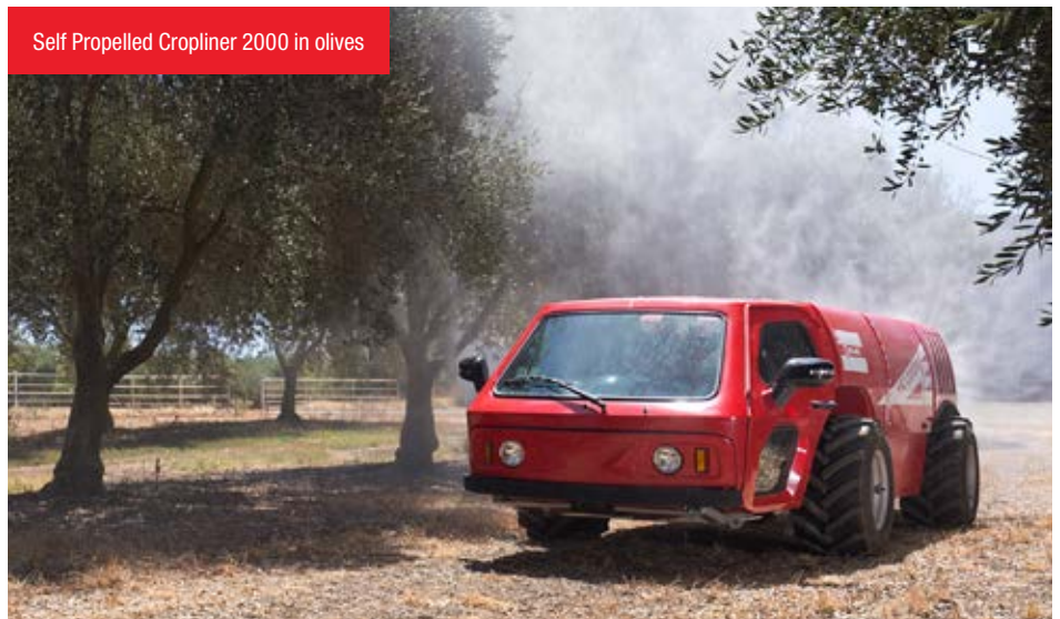
Self Propelled Cropliner 2000 in olives