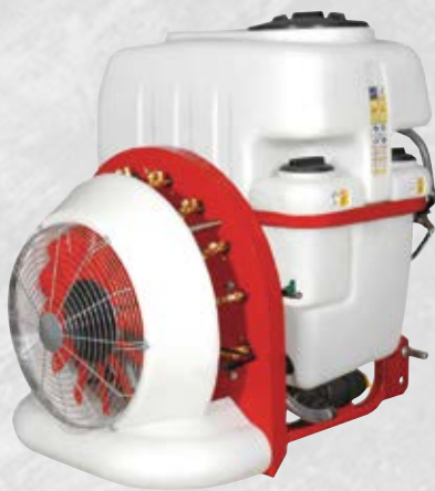
300 litre Cropair with 500mm fan