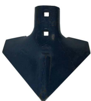
10" x 8mm Dart Point