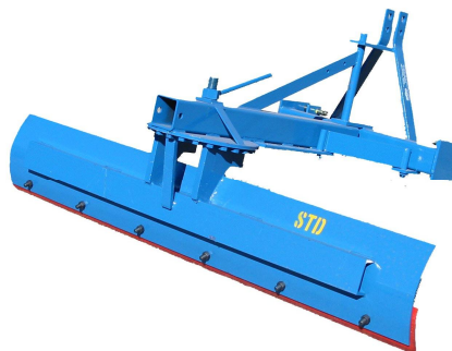
6' Standard Offset