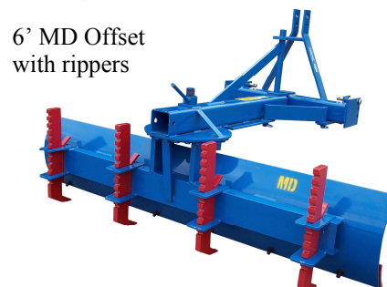
6' MD Offset with rippers