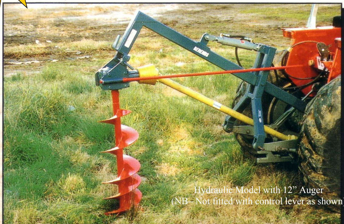
Hydraulic Model with 12" Auger (NB- Not fitted with control lever as shown)