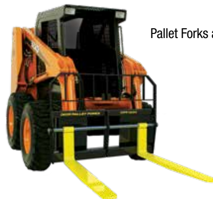
Pallet Forks also available