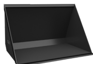
Mini Mulch Bucket