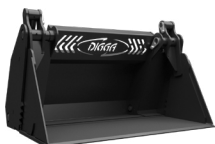
Mini 4 in 1 Bucket