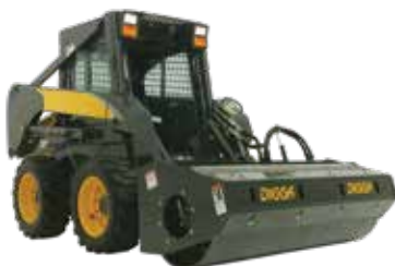
Vibratory Roller also available