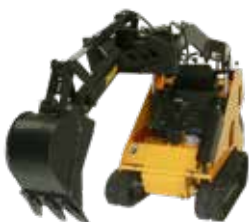
Mini Hoe also available