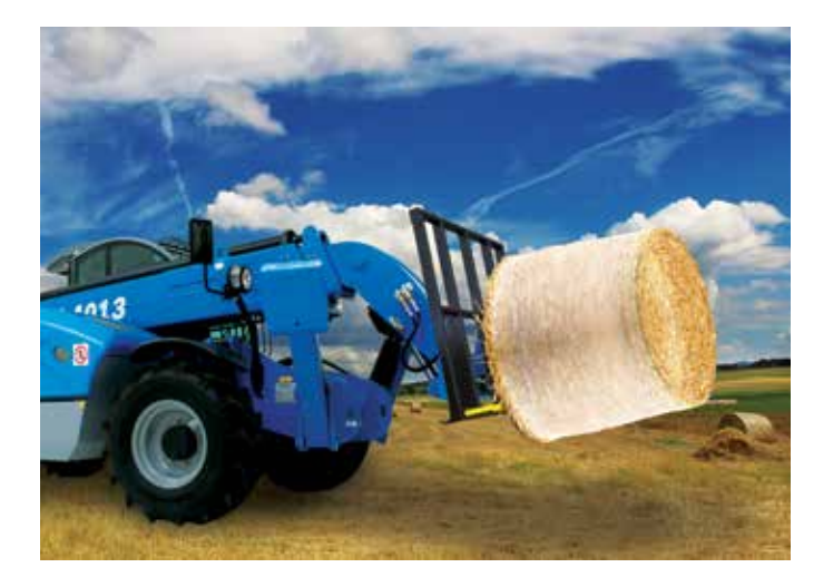
Model with Pallet Forks also available